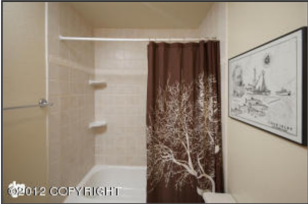
Tub and shower area