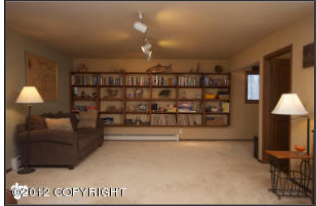
Lots of storage on west wall.