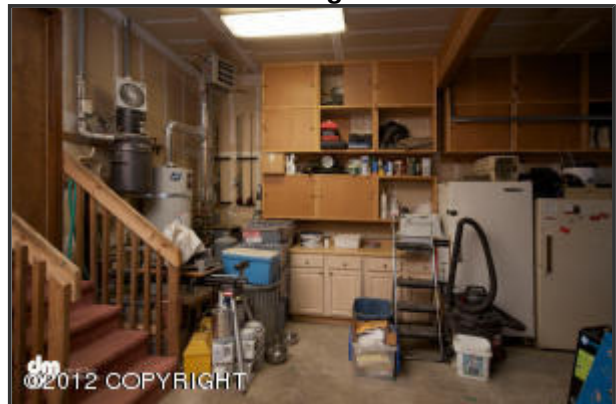
Built in storage on each side of garage. (Where cat will be for showings!)