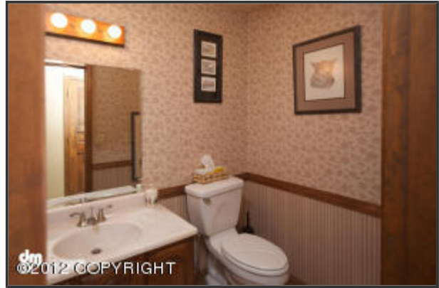
Half Bath on Family Fm/ Living rm level