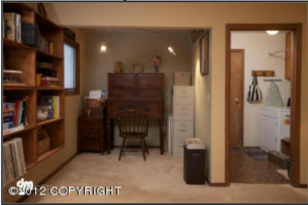
Office nook off family room, and laundry area with door to garage.