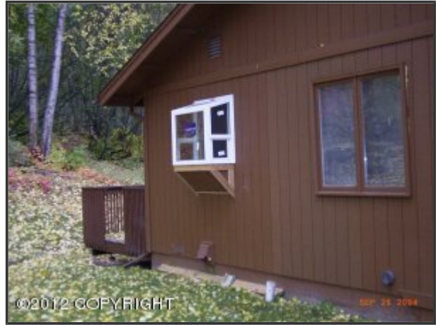
East side of home with garden window from exterior.