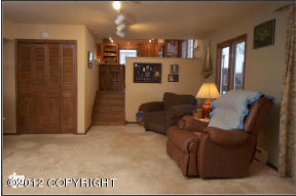
Looking back up to kitchen level