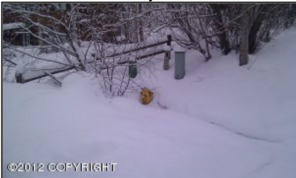
As "country" as this feels, it does have fire hydrants throughout the subdivision, this one on the NE corner of this property, you can see to east of driveway at street level.